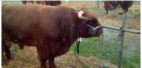
... then the storm