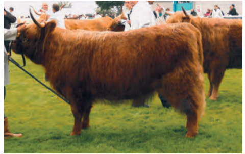
Breed Champion, Highland Show 2012

There was a good turnout of livestock although the show itself is much smaller than the Royal Welsh, but it is still well worth a visit.