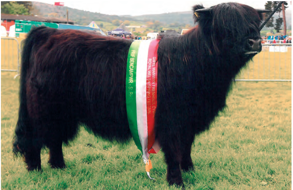
Jarc-Ola Dubh III of Gilden Vale

The two year olds and the yearlings were judged together. There were eight in the class and our yearling Jarc-Ola Dubh of Gilden Vale was placed first on her first time shown! We went forward for the Championship and Jarc-Ola was pulled out as Champion with Furan Froach and her calf as Reserve.