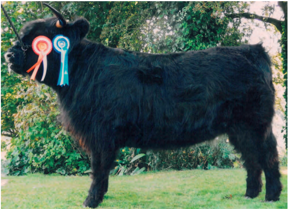
Una Dubh III of Gilden Vale. Glasgow International Show Yearling & Reserve Champion.