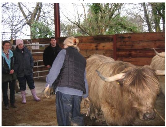
How to approach